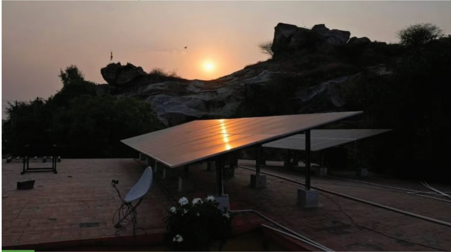
KPI Green Energy

MONEYCONTROL NEWS | AUGUST 16, 2023 / 10:17 AM IST