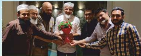
All India Memon Jamat Federation