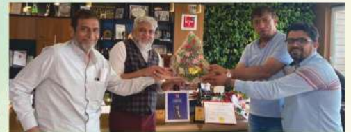
Saurashtra Halai Memon Jamat