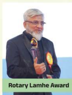
Rotary Lamhe Award