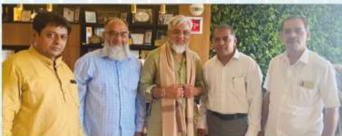
Tankaria Village - Bharuch