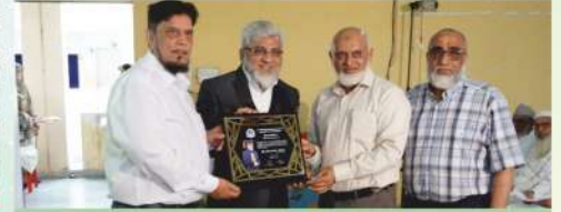
Munshi Manubarwala Trust - Surat