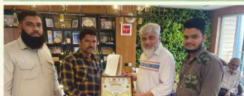
Hindustan Ki Ekta Press