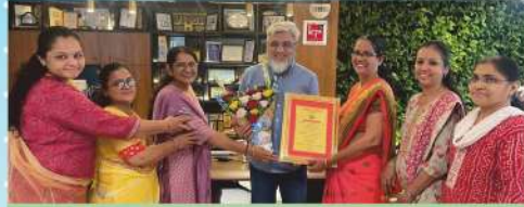
K. S. Joshi English School - Surat