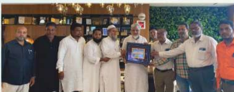
Madani Education Trust - Surat