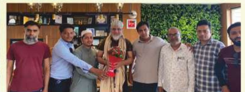
Surat Vohra Samaj