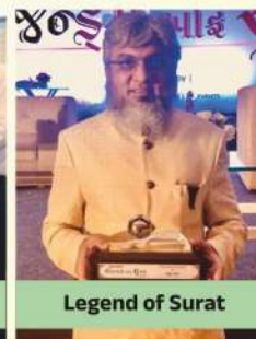
Legend of Surat