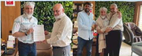
World Bharuchi Vohra Federation - Surat