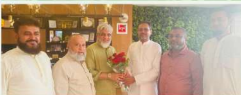
Vohra Samni Village