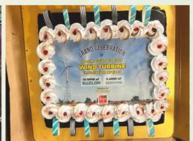
KP team celebrating the successful installation of 7 wind turbines in Kora.