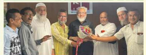
Dargah Compound - Surat