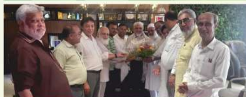
Anglo Urdu Team - Surat