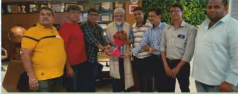
Oldpad Darji Samaj - Surat