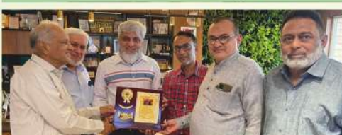
SYMGA School Trust