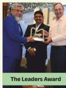
The Leaders Award