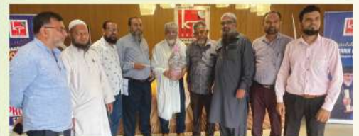
Maharashtra Muslim Samaj - Surat