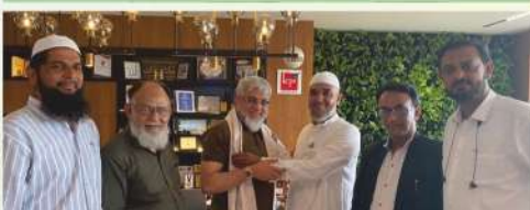
Muslim Brotherhood Library - Surat