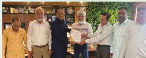
Vohra Samaj - Ahmedabad